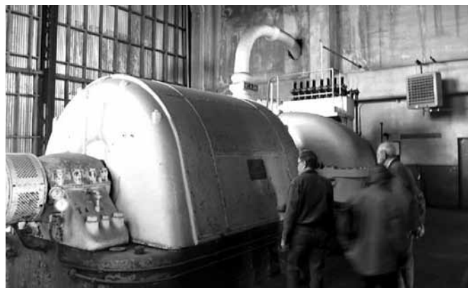
The Seattle Electric Company's Georgetown Steam Plant was built in 1906. It exemplifies America's acceptance of, and then reliance upon, electricity in the early decades of the 20th century.