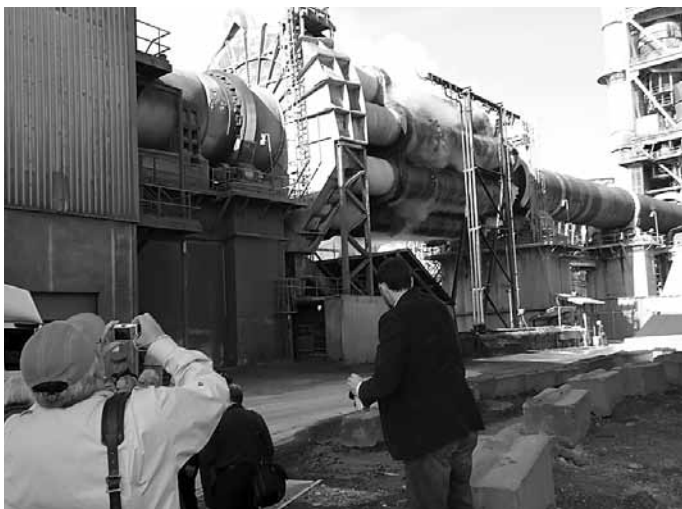
The rotary kiln at the Ash Grove Cement Plant.